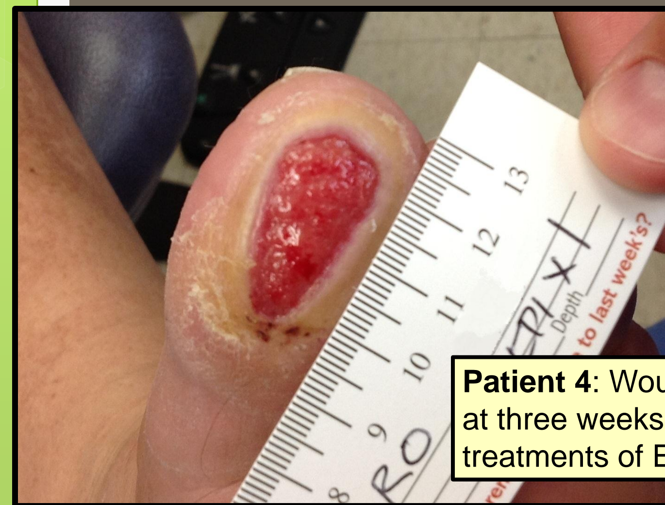
Patient 4: Wound closed at three weeks after two treatments of EpiFix®