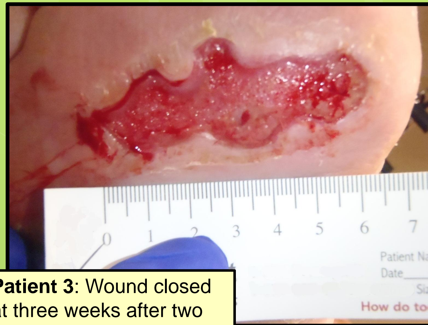
Patient 3: Wound closed at three weeks after two treatments of EpiFix®