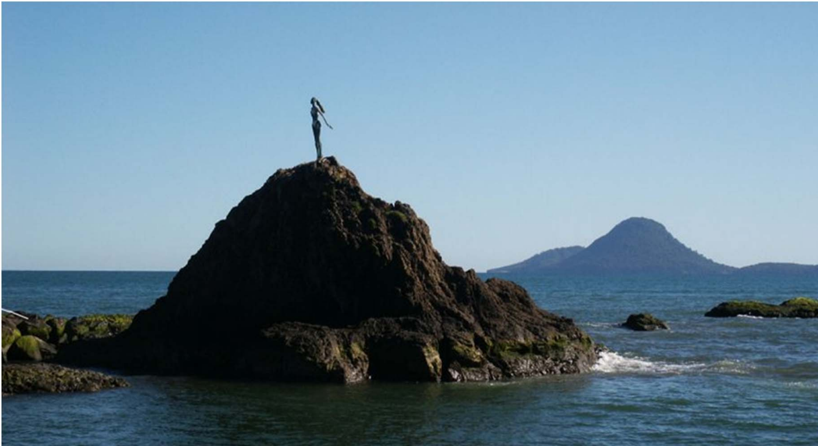
Wairaka , Whakatane