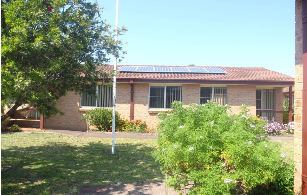
Solar panels installed at Lake Illawarra Village