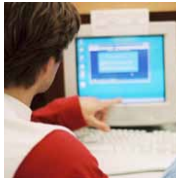
Online training programs