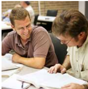
Customized onsite training programs