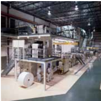
Training & workshops

Since 1915, TAPPI has been one of the best centralized resources for education and training in the pulp & paper, packaging and converting industries. Why not look to us to help provide your mill training programs through a variety of flexible training approaches.