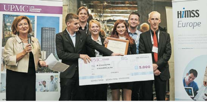
"Eir" from Denmark, the winners of the HTComp for Young Innovators Competition

This international contest for young entrepreneurs and start-up firms focusing on new innovative ideas in the field of health IT and telemedicine, took place during the European Telemedicine Conference. The committee selected three finalist projects: first place, "Eir" from Denmark; second place, "Hispanis Health" from Spain; third place "SmartCare" from Italy.