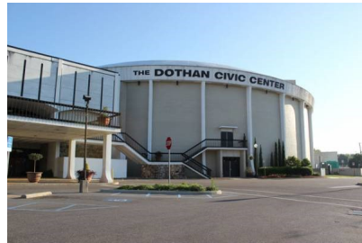
EXHIBIT HALL EVENT HOURS Friday, April 5, 2019 9:00 am - 12:00 pm

DOTHAN CIVIC CENTER | Main Arena 126 North St. Andrews Street Dothan, AL 36303