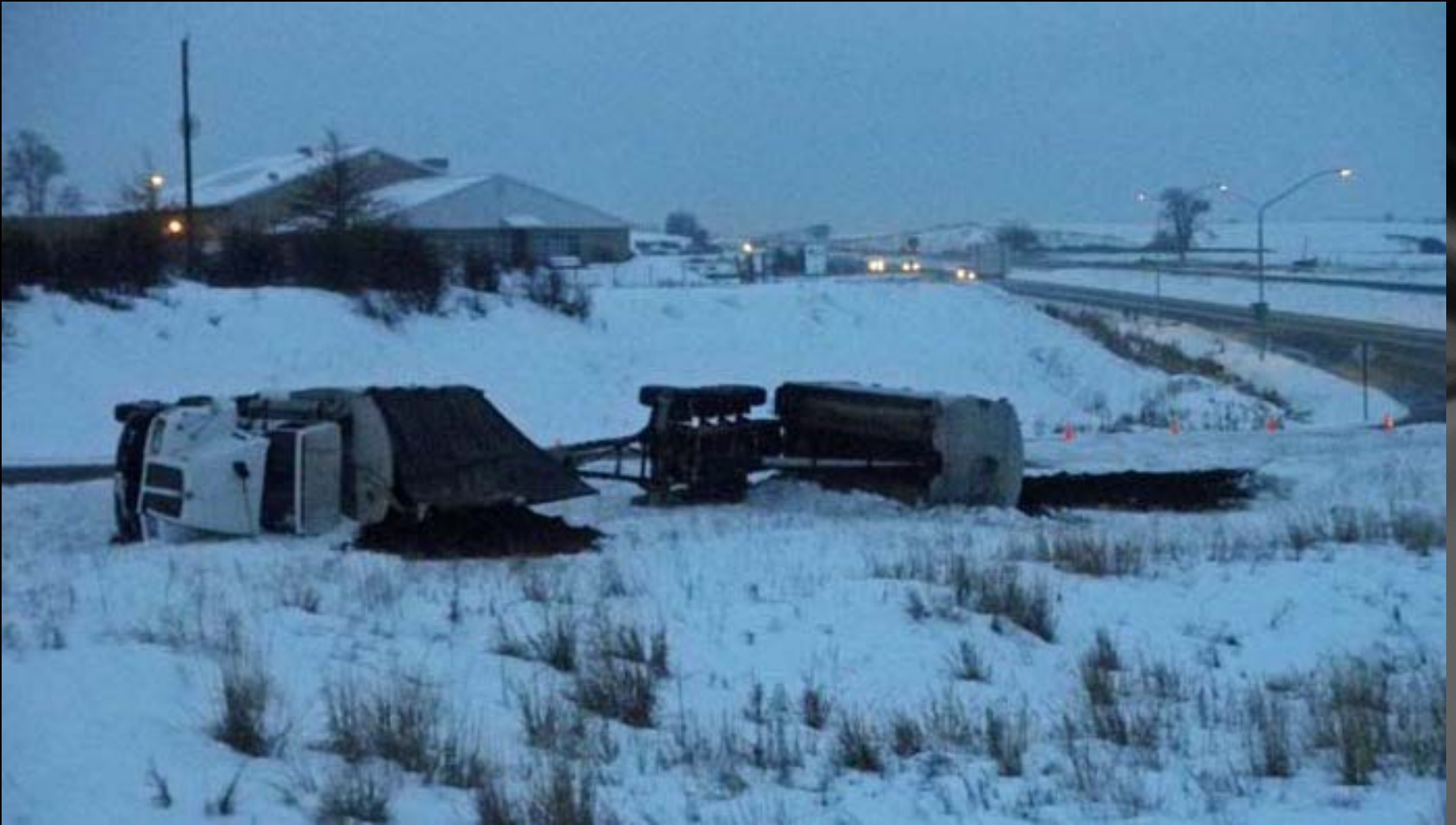
Driver not aware of ice on off-ramp, I-90 Thorp, WA