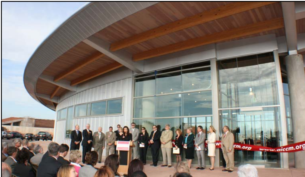
2008 VISITOR CENTER DEDICATION