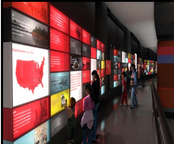
SOUTH GALLERY TIMELINE