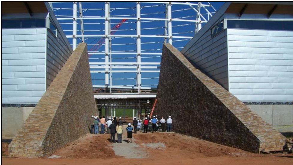
2010 EAST GATE ENTRY DEDICATION