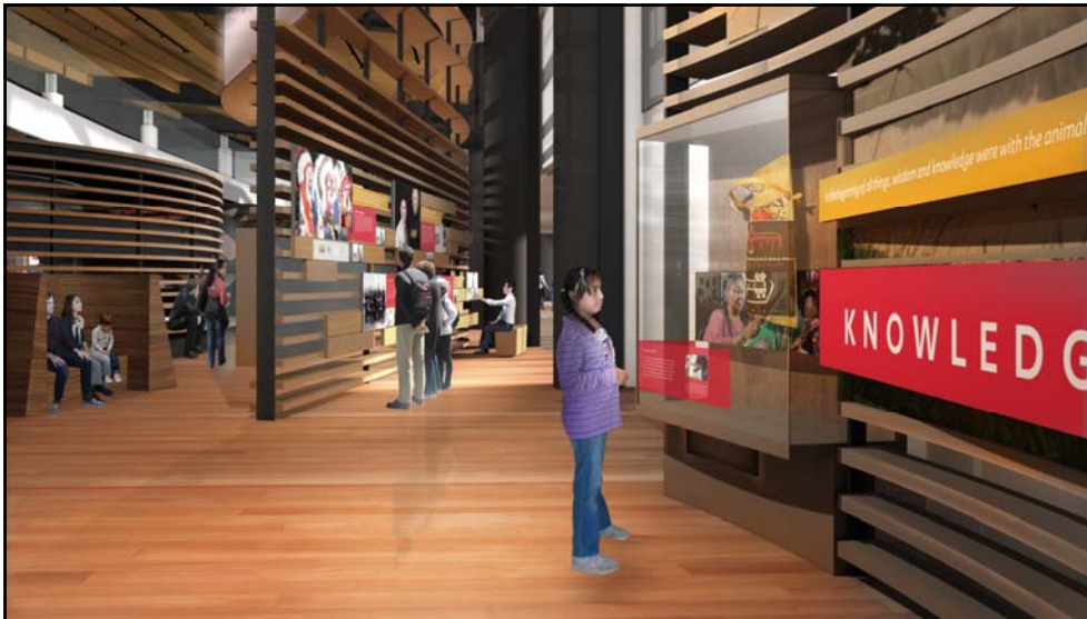
The Center has the opportunity to display Native American artifacts now held by the Smithsonian.