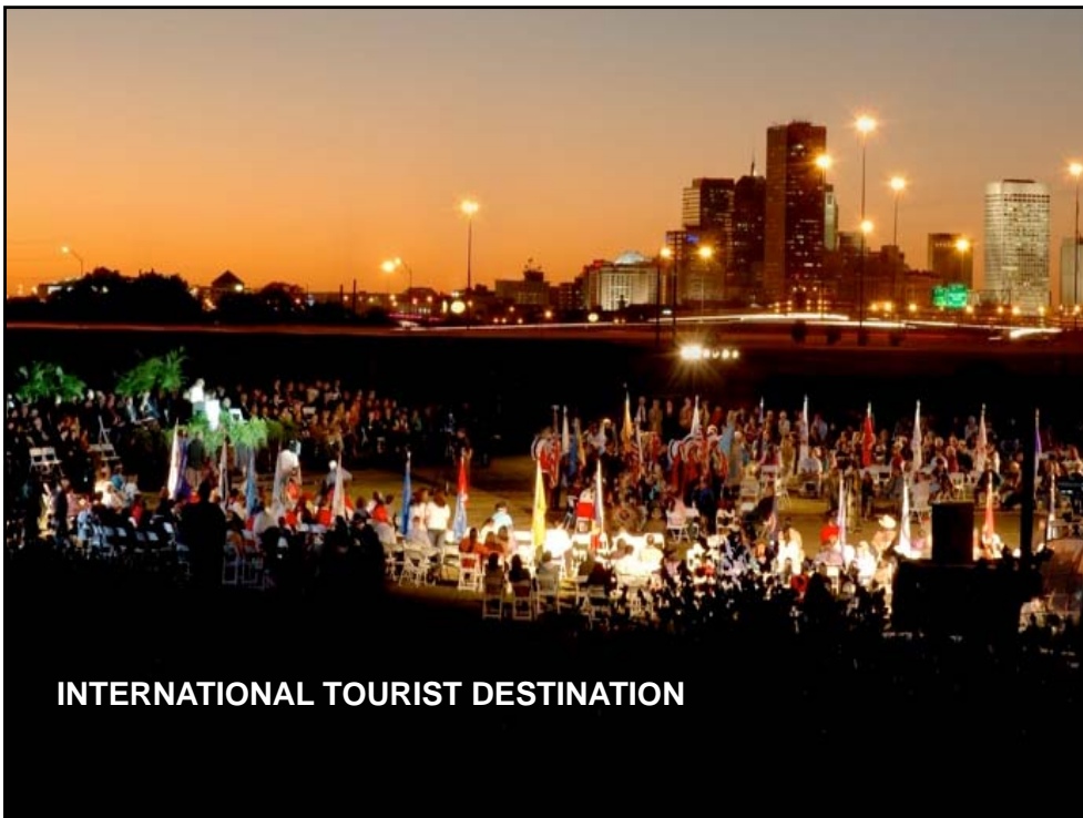
INTERNATIONAL TOURIST DESTINATION