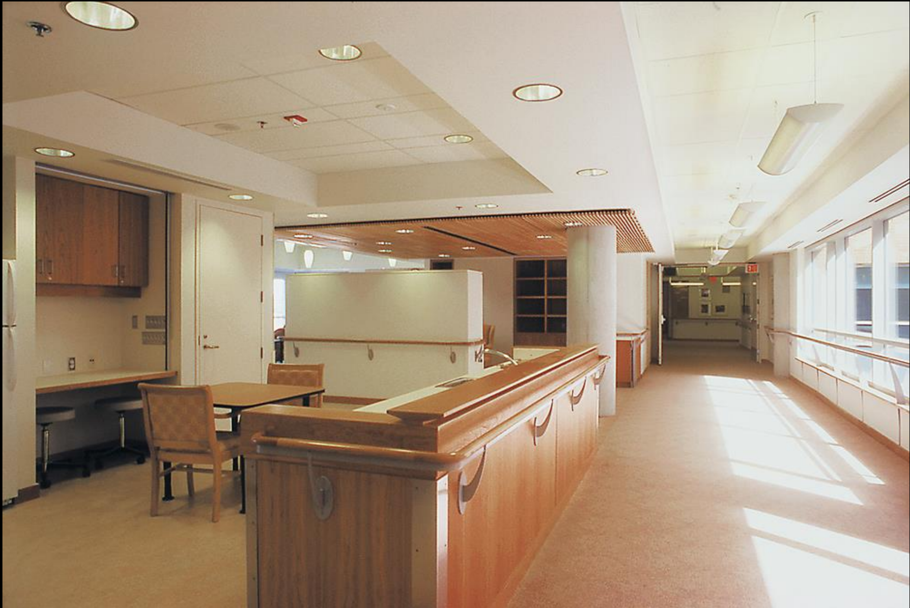
Apotex Centre Jewish Home for the Aged, Baycrest, Toronto, Diamond Schmitt Architects / Boigon Petroff Shepherd