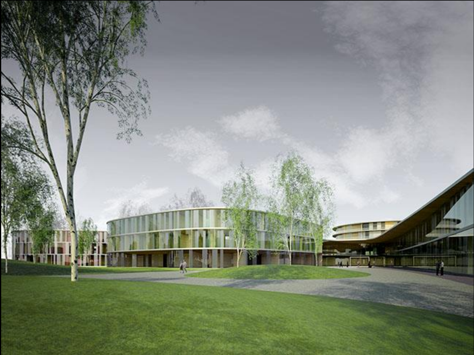
Espoo Hospital and the Life and Living Centre for Senior Citizens, Espoo Finland, K2S Architects