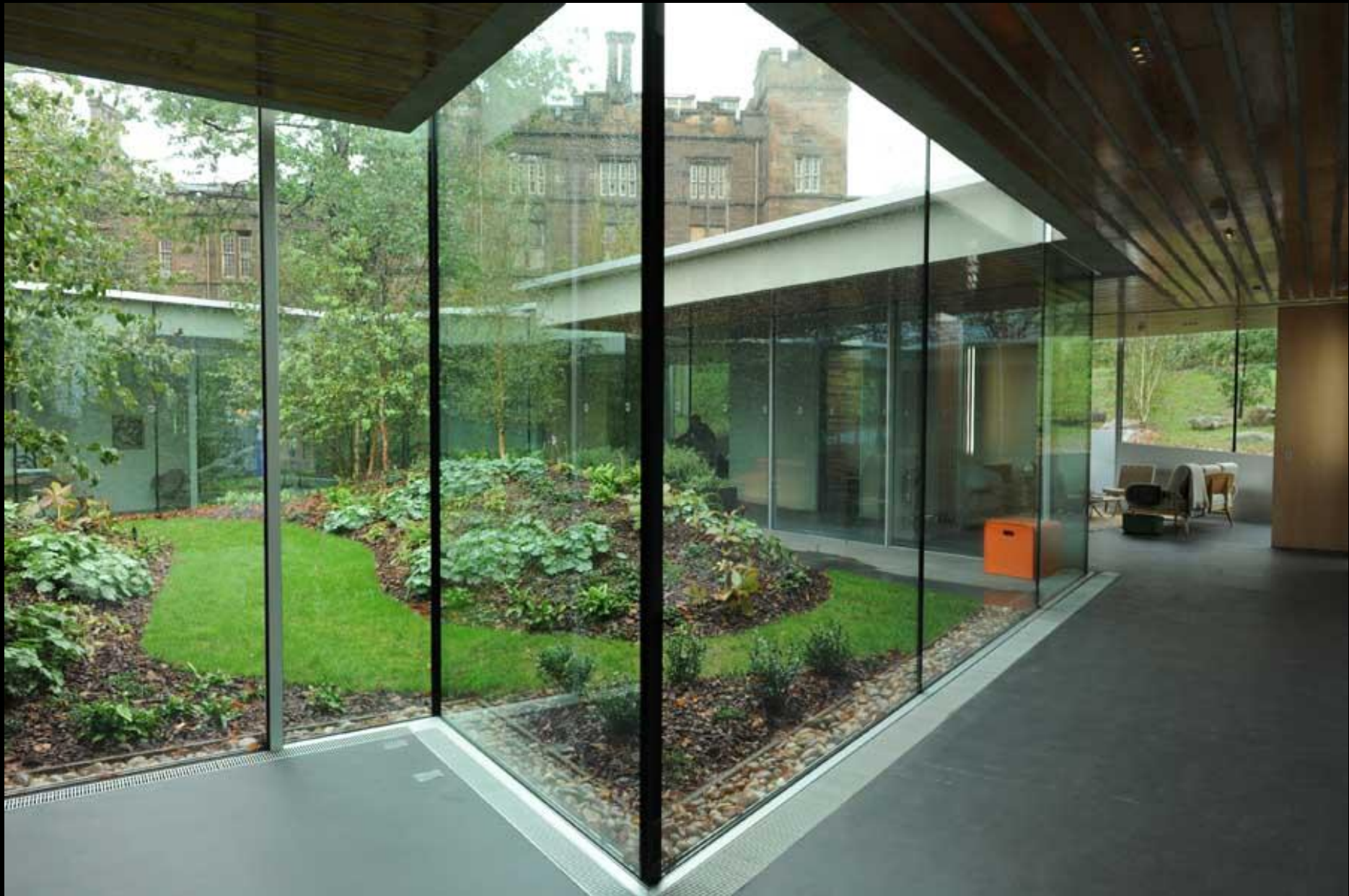
Maggie's Centre, Gavarnel UK, OMA