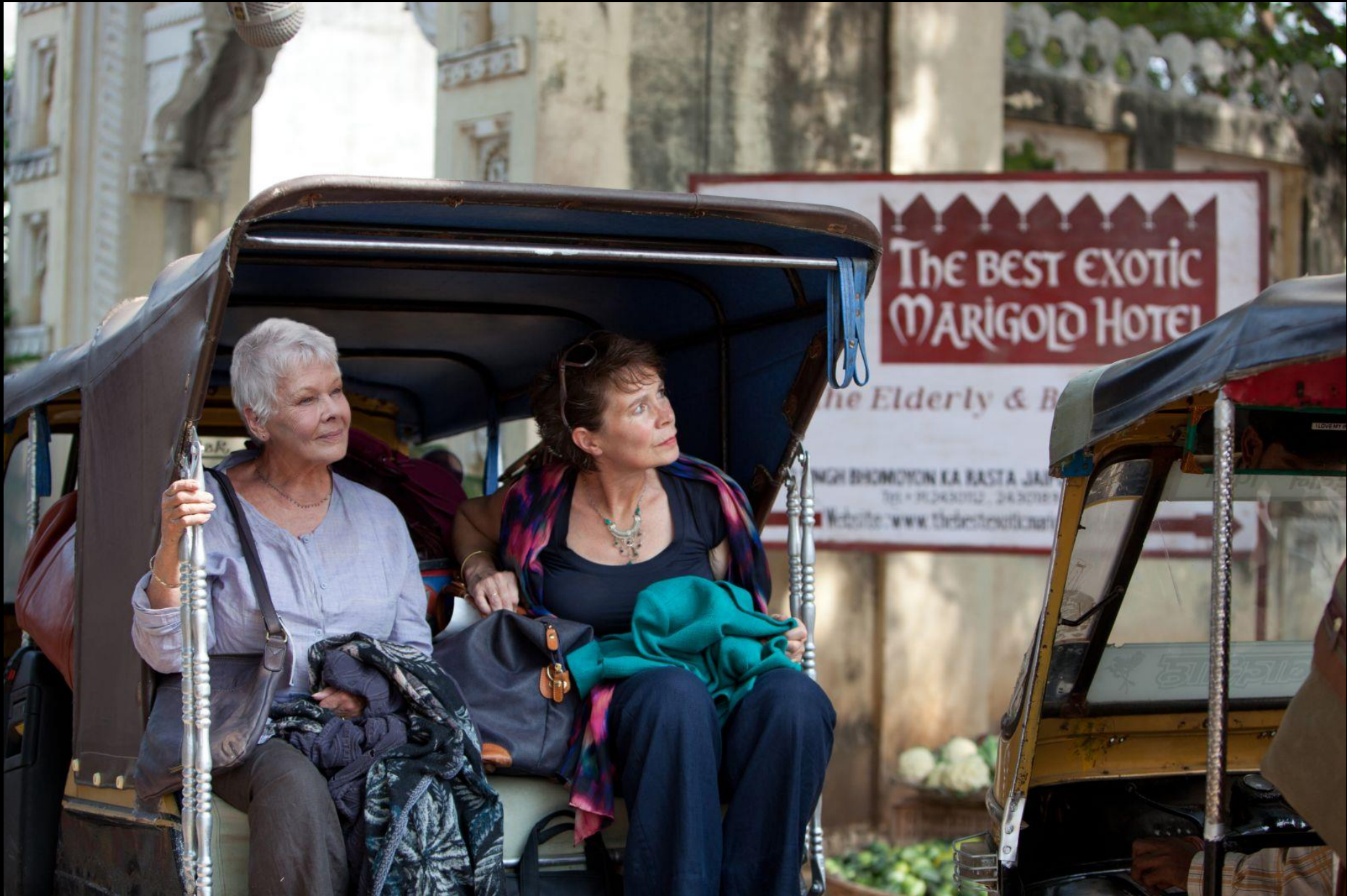
The Best Exotic Marigold Hotel