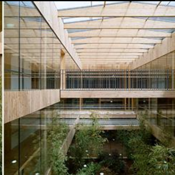
Steinfeld Retirement and Nursing Home in Steinfeld Austria by Dietger Wissounig Architekten