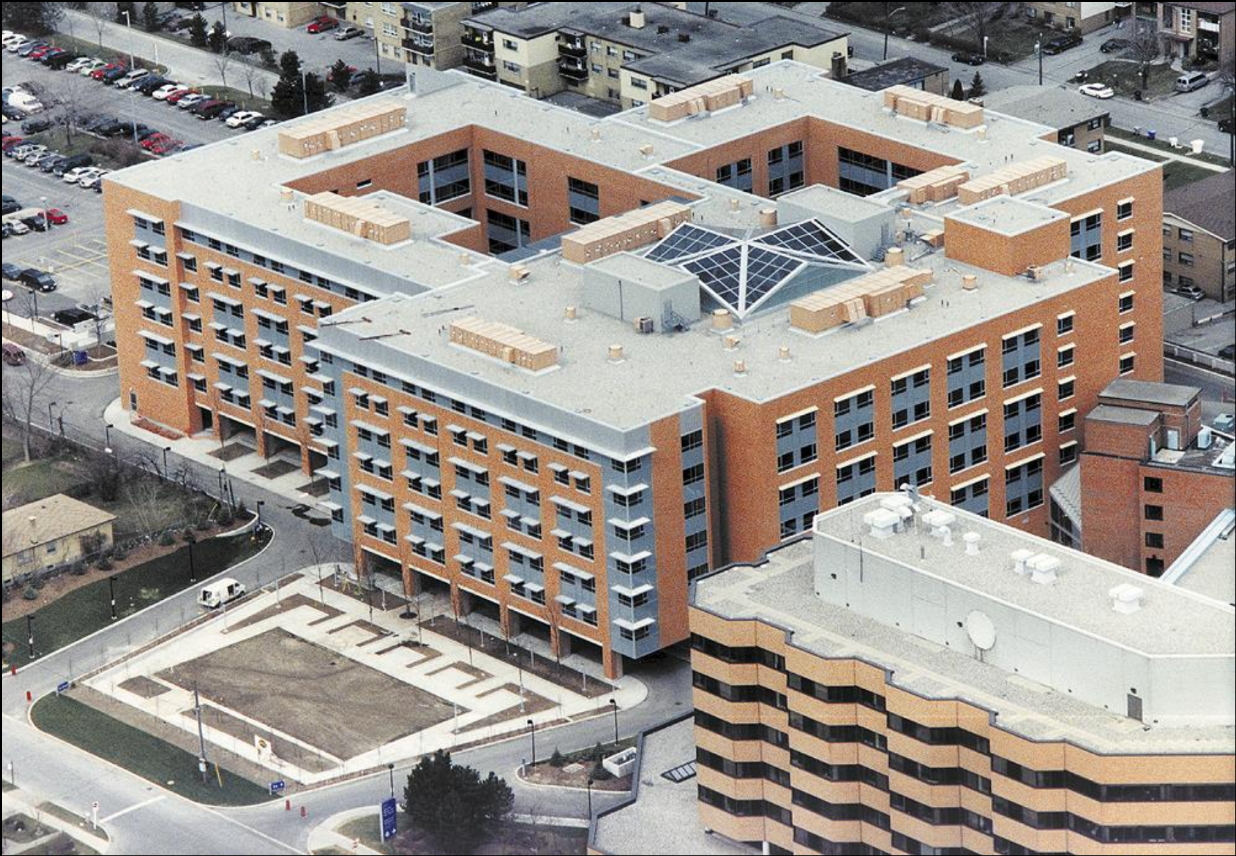
Apotex Centre Jewish Home for the Aged, Baycrest, Toronto, Diamond Schmitt Architects / Boigon Petroff Shepherd