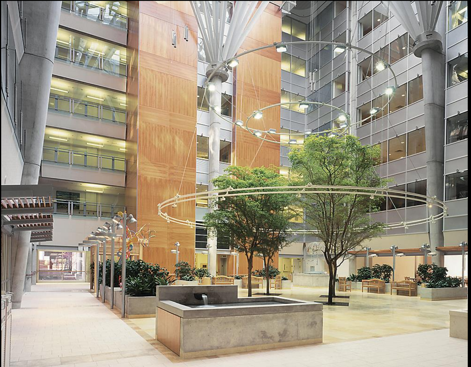
Apotex Centre Jewish Home for the Aged, Baycrest, Toronto, Diamond Schmitt Architects / Boigon Petroff Shepherd