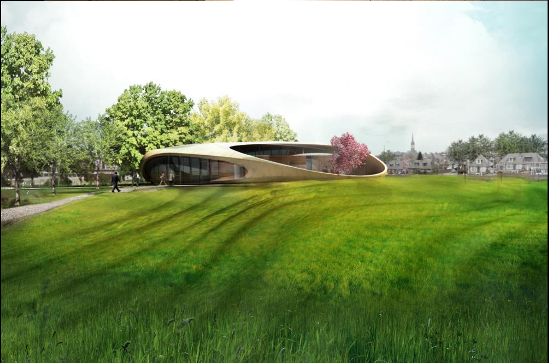
Maggie's Centre, UK, Snohetta