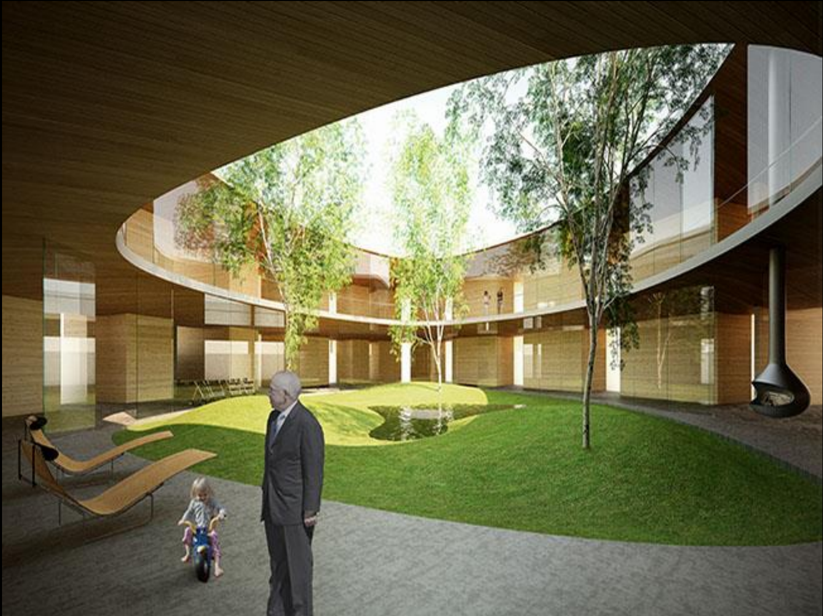
Espoo Hospital and the Life and Living Centre for Senior Citizens, Espoo Finland, K2S Architects