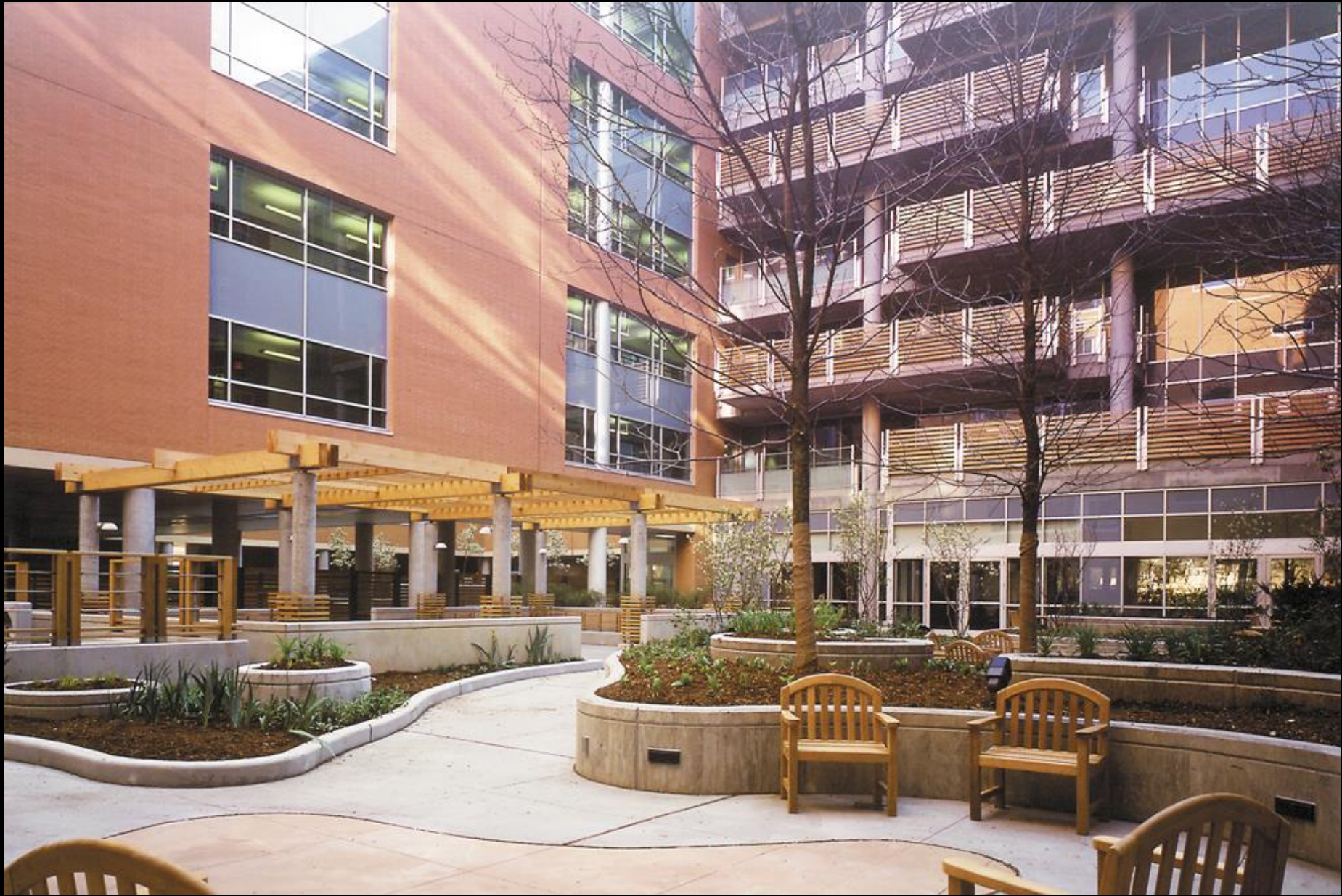
Apotex Centre Jewish Home for the Aged, Baycrest, Toronto, Diamond Schmitt Architects / Boigon Petroff Shepherd