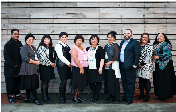
Te Poari o Te Rūnanga o Aotearoa NZNO

Te Rūnanga membership comprises over 3000 nurses (nurse practitioners, registered, enrolled and student nurses), midwives; kaimahi hauora, health care assistants and allied health professionals.