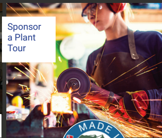
Sponsor a Plant Tour