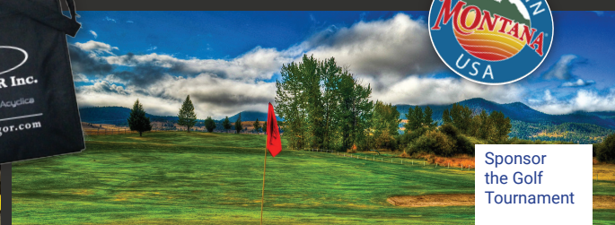
Sponsor the Golf Tournament