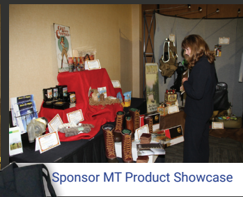
Sponsor MT Product Showcase

Sponsor a Conference Item! KG KAR-GOR Inc. FLIR Acrylics www.kargor.com