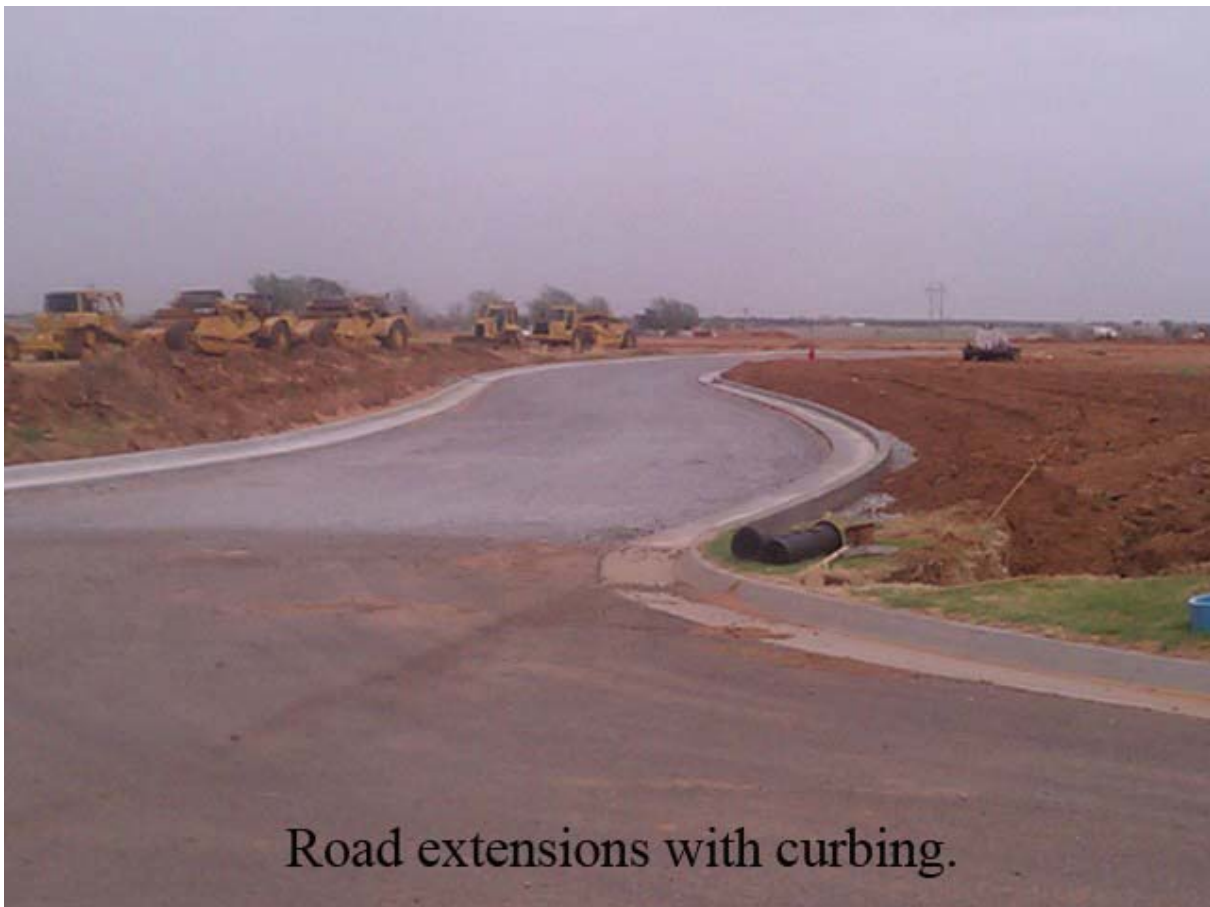
Road extensions with curbing.