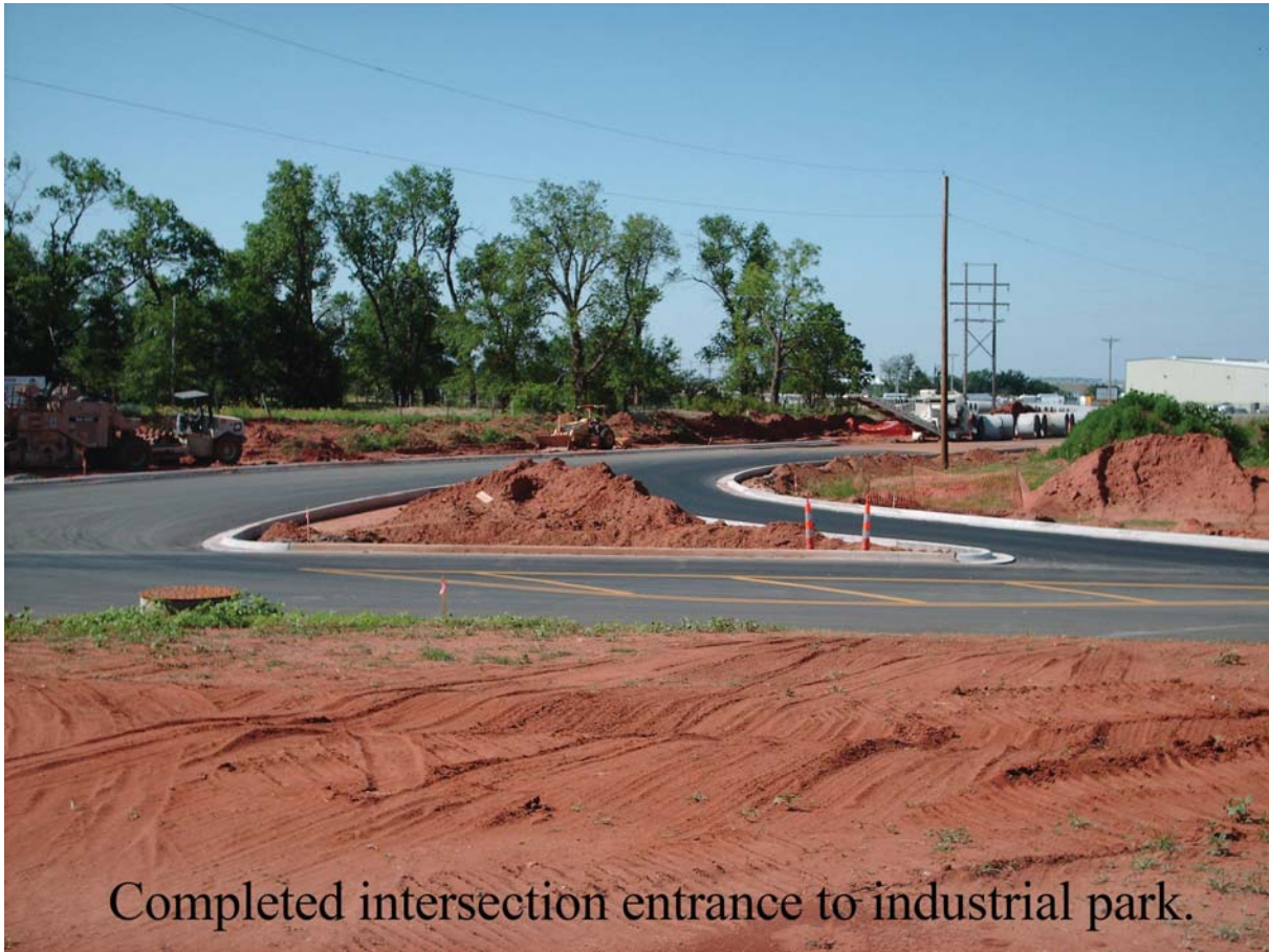
Completed intersection entrance to industrial park.