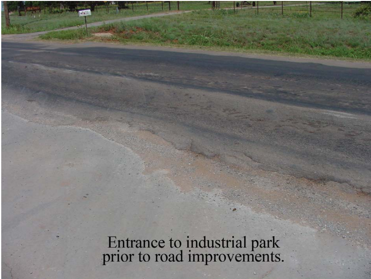
Entrance to industrial park prior to road improvements.