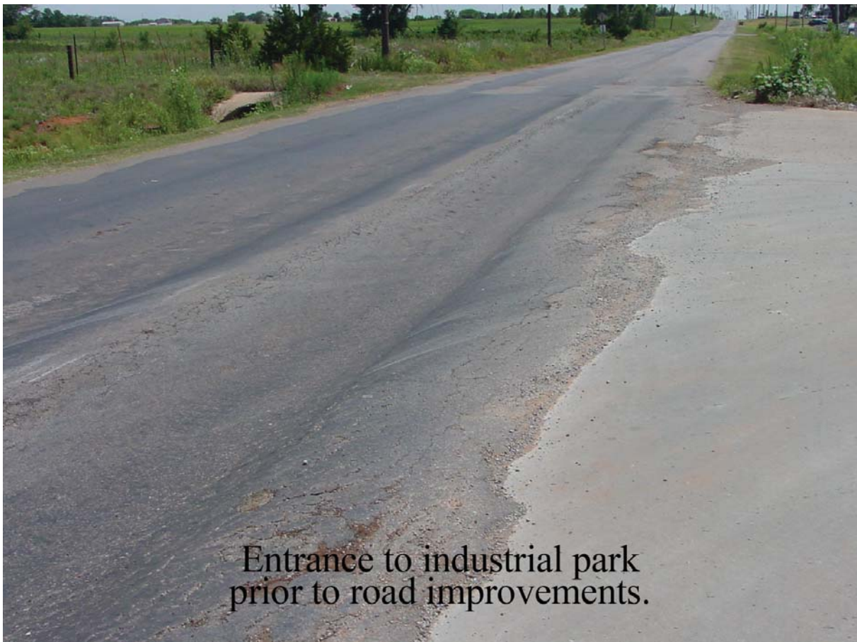
Entrance to industrial park prior to road improvements.