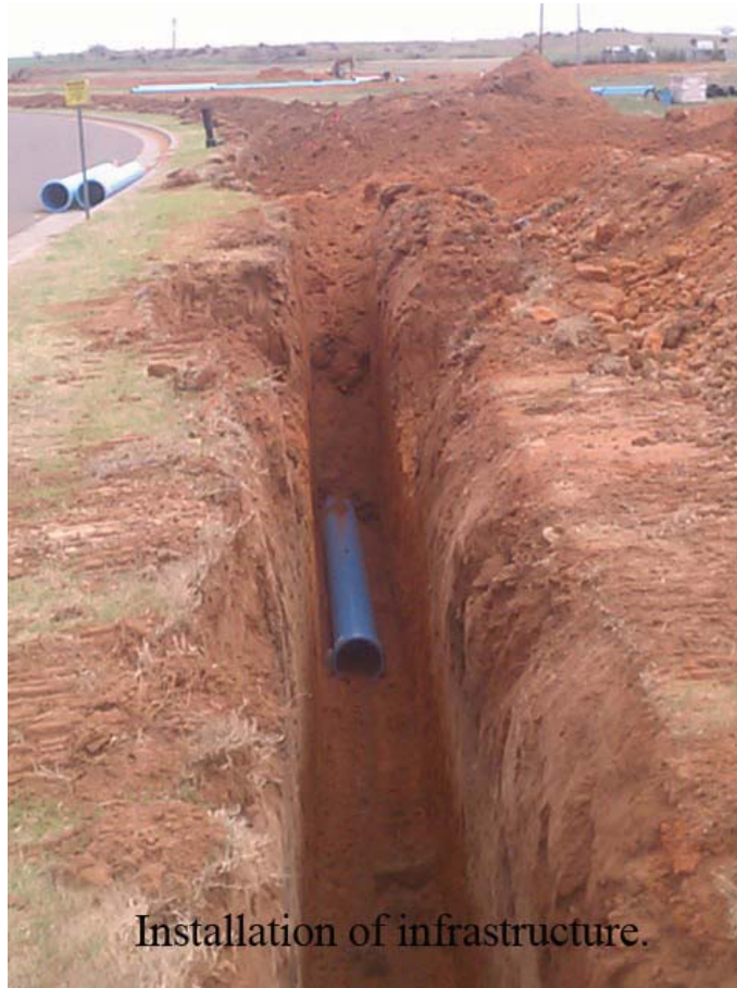
Installation of infrastructure.