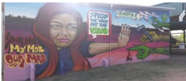
Forbes High School