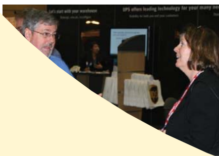
Exhibit at NCOF to boost your bottom line this year!