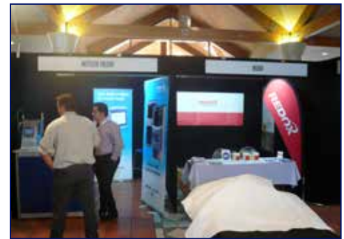
Conference Exhibitors 2014