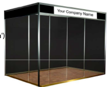
Image shows a 3m x 2m open corner booth (flooring not inc in package)

Note: Some booths will not have an end wall unless specifically requested.