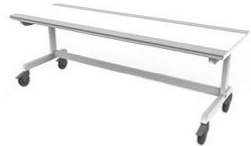
Table weight limits