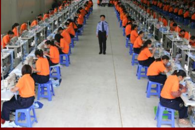
Women in a Compulsory Drug Detention Centre in China