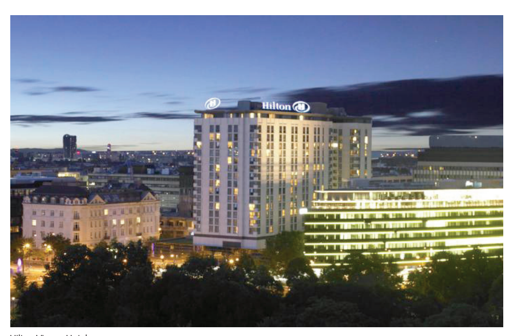
Hilton Vienna Hotel