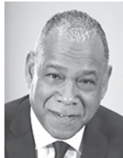
Mitchell Silver USA