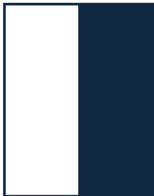
HALF PAGE (Vertical) 4.25" (W) 11" (H)