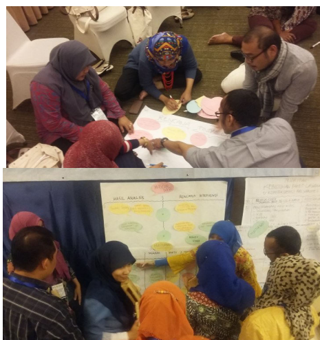
Health care workers who are invited to participate in the ToT were making and presenting their Action Plan.

All 5 provinces' Action Plan came up with Context Building - where SOGIE ( Sexual Orientation Gender Identity and Expression ) and Human Rights issues are integrated - as their module of choice to be shared with other peers/health workers and other lines in their station: security guards, receptionist staffs and others. They expressed their confidence by having all lines sensitized, the health services free of stigma and discrimination will come into reality.