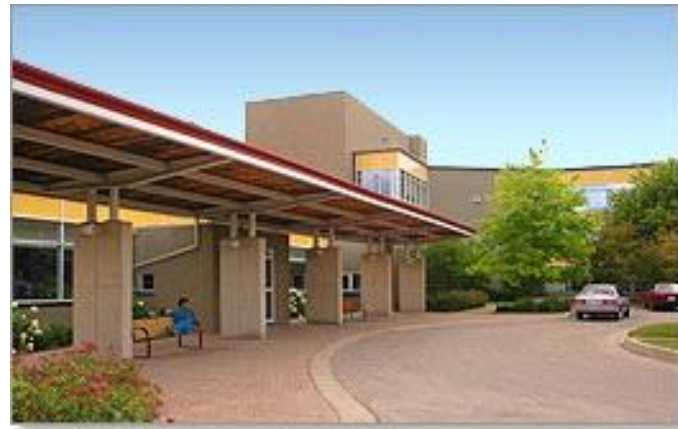
peopleCare AR Goudie Kitchener