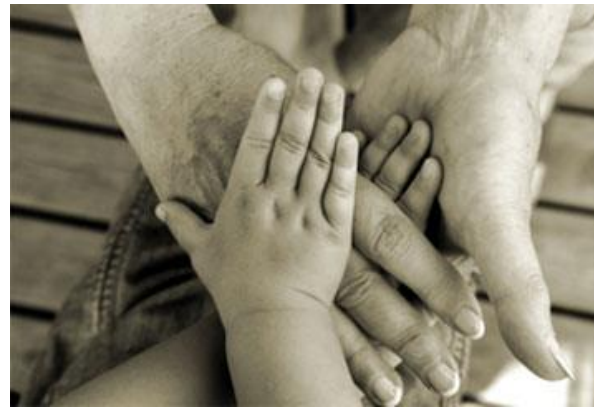
Delhi Long Term Care Home