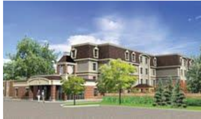
peopleCare Hilltop Manor Cambridge