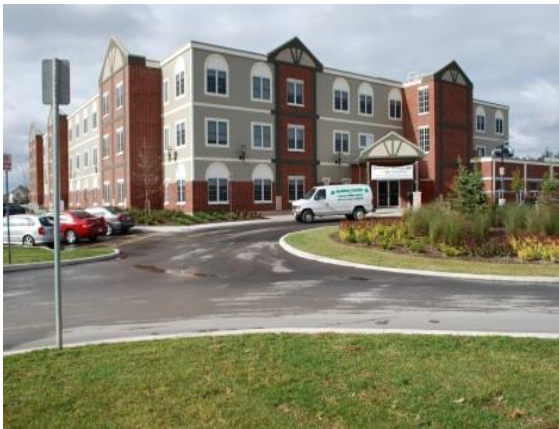
peopleCare Oakcrossing London