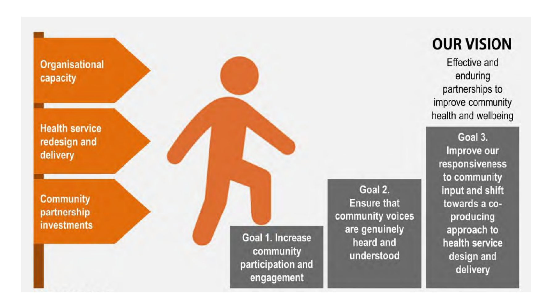
Extract from SESLHD Consumer Partnership Strategy 2015

In line with the SESLHD Equity Strategy<sup>3</sup> HOT team sought to enhance a partnership with consumers to develop healthy communities. Annual consumer satisfaction surveys of HOT consumers revealed a need for peer led consumer participation in the design and delivery of services, this was recognised as an important indicator for moving beyond a top-down approach consultative approach towards a genuine and equal partnership <sup>2</sup>.