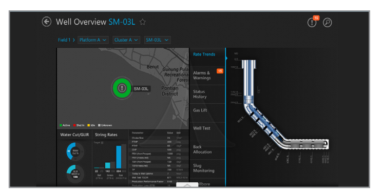
The Avocet platform enables decision support of the asset in a single integrated environment.

The infrastructure of the Avocet platform facilitates high-frequency data collection, computation, and alarming. With transparent access to model results, aggregated sensor data and high-frequency sources enable a powerful range of capabilities.