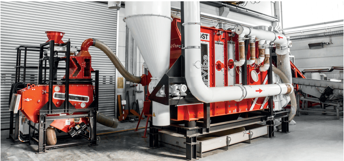
Separation Table, K-Sifter and Vibration Air Separator AirVibe

Zig-Zag Separators, Drum Separators, Vibration Air Separators, Separation Tables among others – for more than 95 years successful in operation.