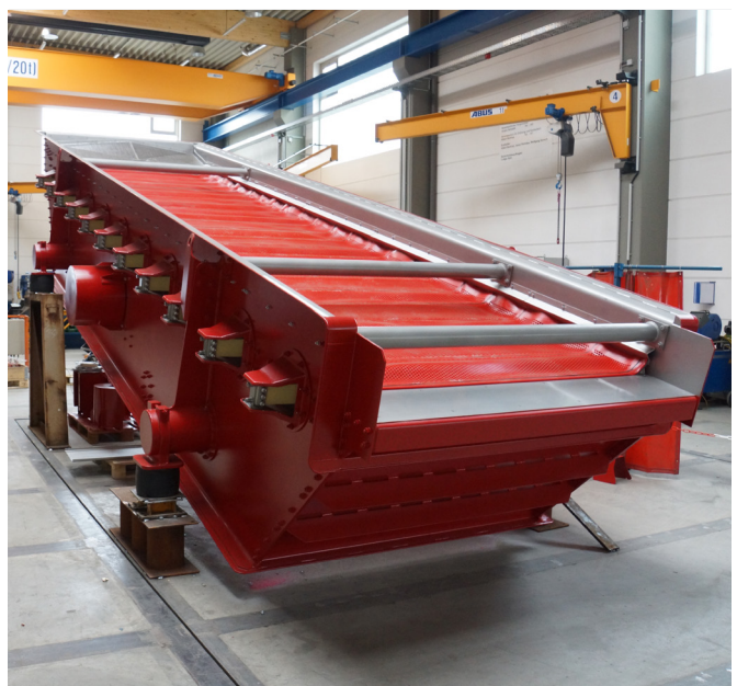
Flip-Flow Screen OSCILLA