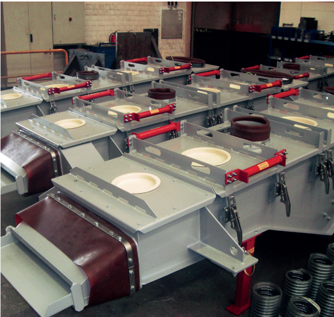
Vibrating Trough Type Feeder

Recycling means variety. Versatile are also our solutions for feeding and dosing of the most variable mixtures. Unbalanced and magnetic drives from JOEST are used.