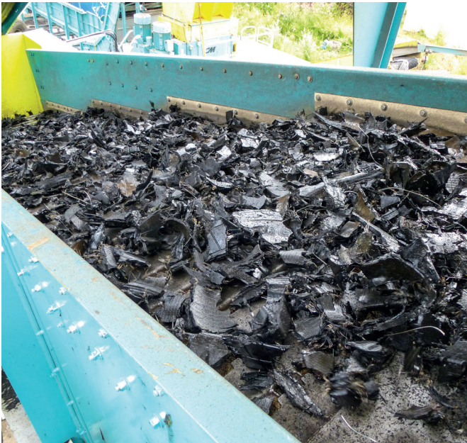
Finger Cascade Screen TopSpin

Like the variety of bulk material, there is a variety of screening technologies to handle them. A selection from JOEST's range of screens include the Finger Cascade Screen TopSpin, Flip-Flow Screen OSCILLA or the Combination Screen TOPCILLA.