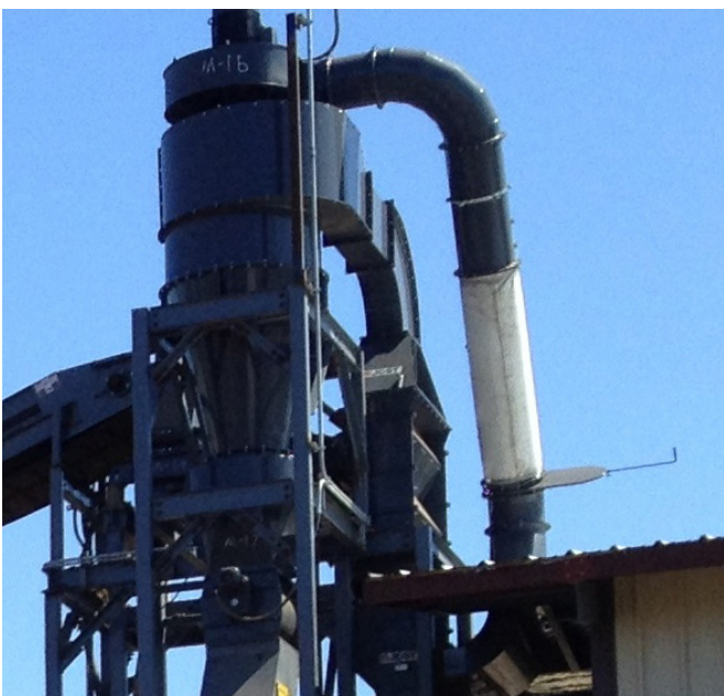
Zig Zag Air Separator