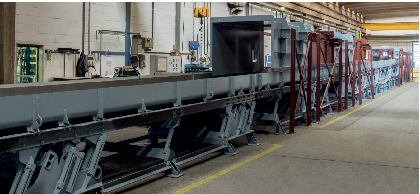
Vibrating Trough Type Feeder for Transport of Waste Slag