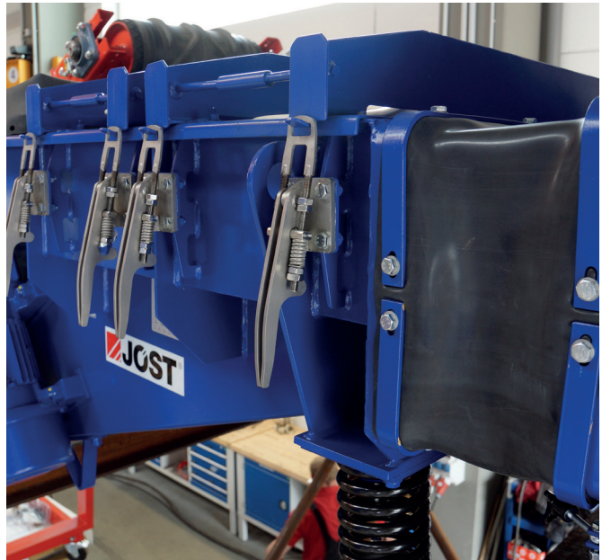
Vibrating Trough Type Feeder