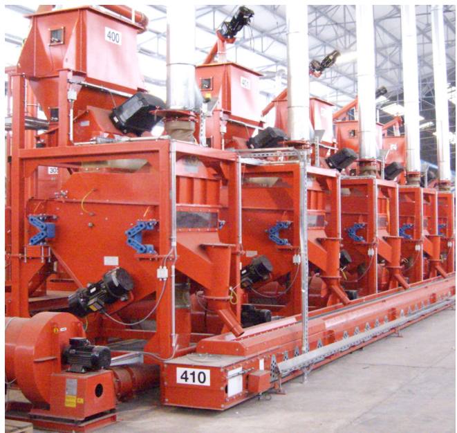
Separation Tables with Dosing Station