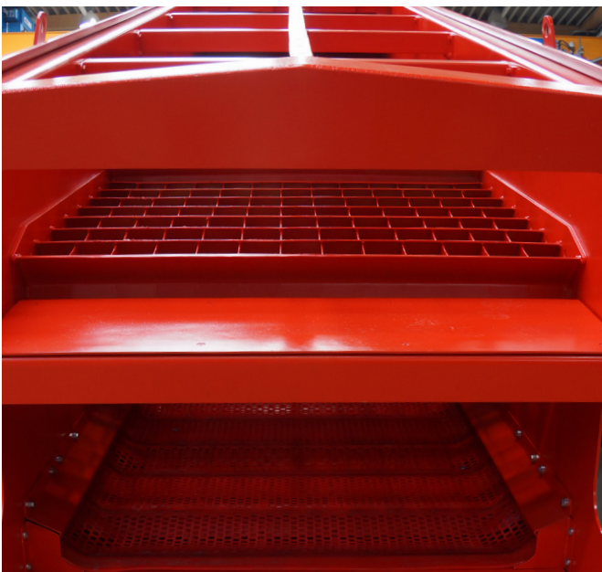
Combination Screen TOPCILLA