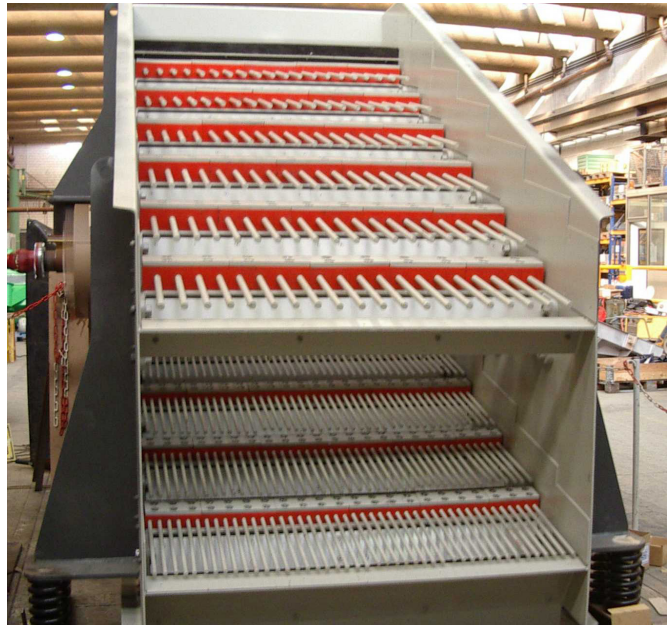
Rod Screen Stabroflex