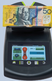
COUNTEASY TS Touch Screen Note & Coin Scale