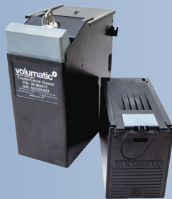
COUNTERCACHE POS Mounted Safe with Metal Deposit Box