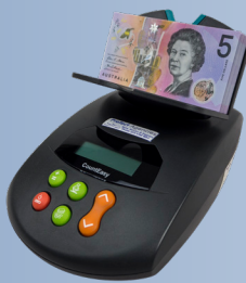
COUNTEASY Note & Coin Scale