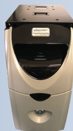
COUNTERCACHE INTELLIGENT POS Mounted Safe with Fully Integrated Note Counter & Validator