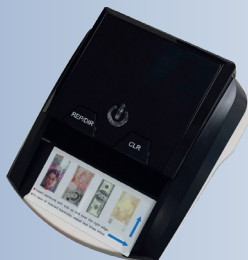
MCD-705 Automated Multi-currency Counterfeit Detector