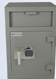
DROP SAFE Deposit Chute Safe