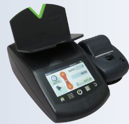
COUNTEASY IP Touch Screen Note & Coin Scale with Integrated Printer System