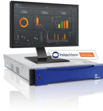
Artificial Intelligence powered by BriefCam