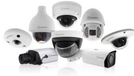
BX Camera Range