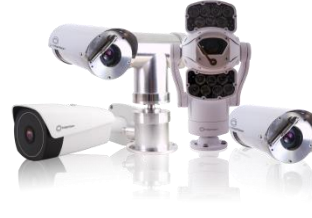
Specialized Camera Range