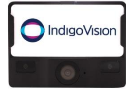
Body Worn Video