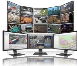
IP Video Wall