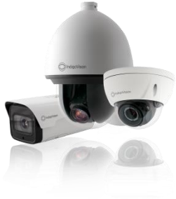
HD Ultra Camera Range