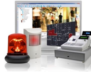
Software Development Kit (SDK)