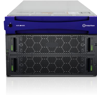
Large Enterprise NVR-AS 4000