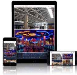
Control Center Mobile