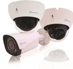
GX Camera Range