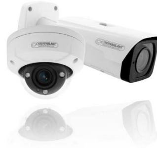
CyberVigilant® in Camera