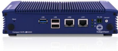
Compact NVR-AS 4000