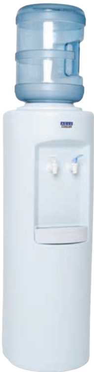
Model Selection Chart