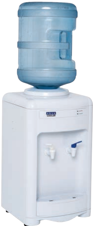
Model Selection Chart

Allure is available in either bottled or mains-connected configurations and will look right at home on a kitchen bench or small-office break room. These units can dispense 2 L/h cold water and come with our standard twelve month warranty and additional twenty-four month refrigeration circuit warranty. As with all our water coolers, a full range of replacement parts are available to keep the unit in operation for longer.