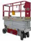
26ft Narrow 9.75 m Working Height