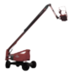
80ft Knuckle 25.6m Working Height