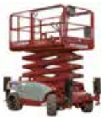
32ft 12.06m Working Height