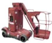
Star 10 10m Working Height