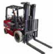
3T Gas Counterbalance Forklift Lift height: 5.5 meters Lift capacity: 3 tonnes