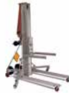
Duct Lift 5.1-7.3 Working Height Various sizes available