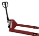
2.5T Pallet Jack Strong construction 5 pump max height Standard size pallets