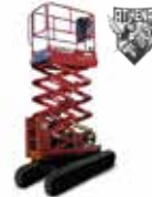
Bi-levelling 7.9m Working Height