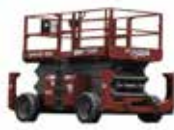
53ft 18.15 Working Height