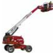
46ft Straight 16.02m Working Height