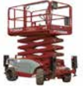
26ft 9.92m Working Height