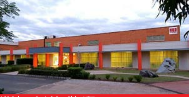
ACO Polycrete Pty Ltd, Emu Plains NSW.