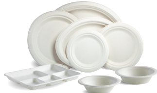
Plates, bowls & trays