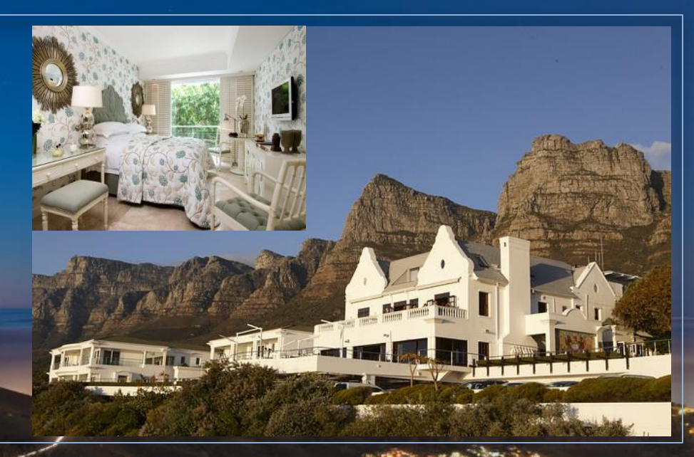
Table Bay Hotel

Full English Breakfast, unlimited Wi-Fi access and transfer service to Camps Bay and the V & Waterfront between 8:00am and 9:30pm.