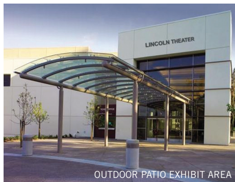
OUTDOOR PATIO EXHIBIT AREA