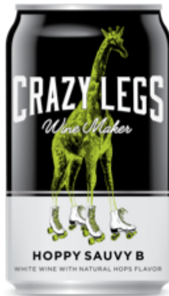
Hoppy Sauvy B