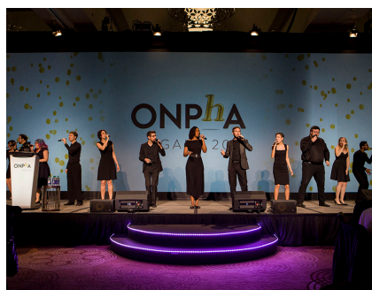
2016 ONPHA Gala entertainment