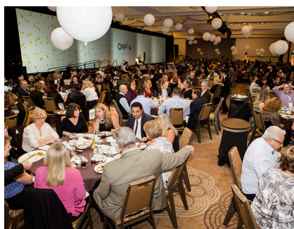
2016 ONPHA Gala

Sponsor a specific session offered as part of educational program on November 3 and 4.