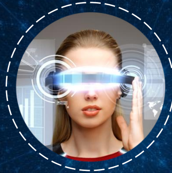
Ring scanner + Smart glasses