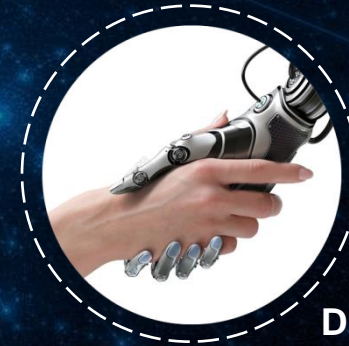
DHL + HUAWEI+HYCO