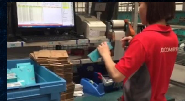
JD Warehouse, efficiency improved by 10%!