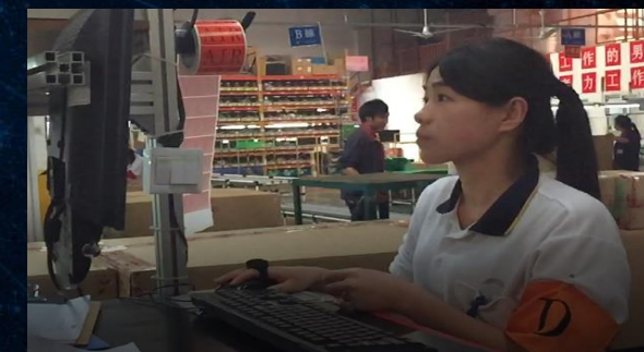
JOHNSON, improve working efficiency!