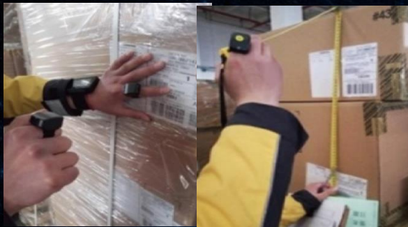
Coach Project, More efficient! Easier !