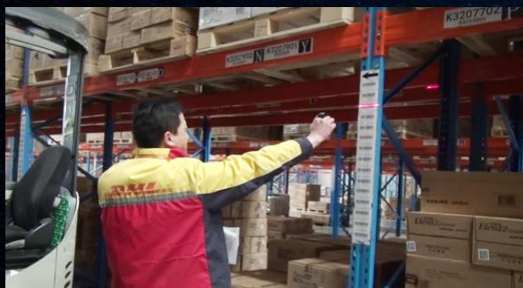
MARS Project, Paperless operation!