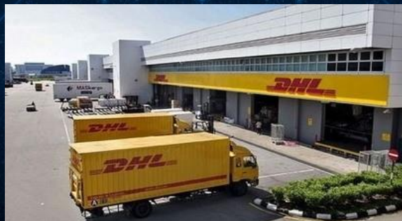
Parking scheduling system, track data changes in real time!