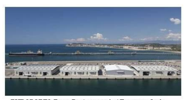
EUROPORTS Forest Products terminal Tarragona, Spain