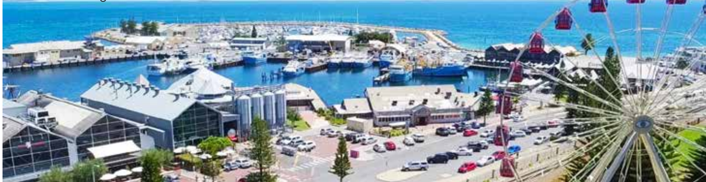
Fremantle Fishing Boat Harbour