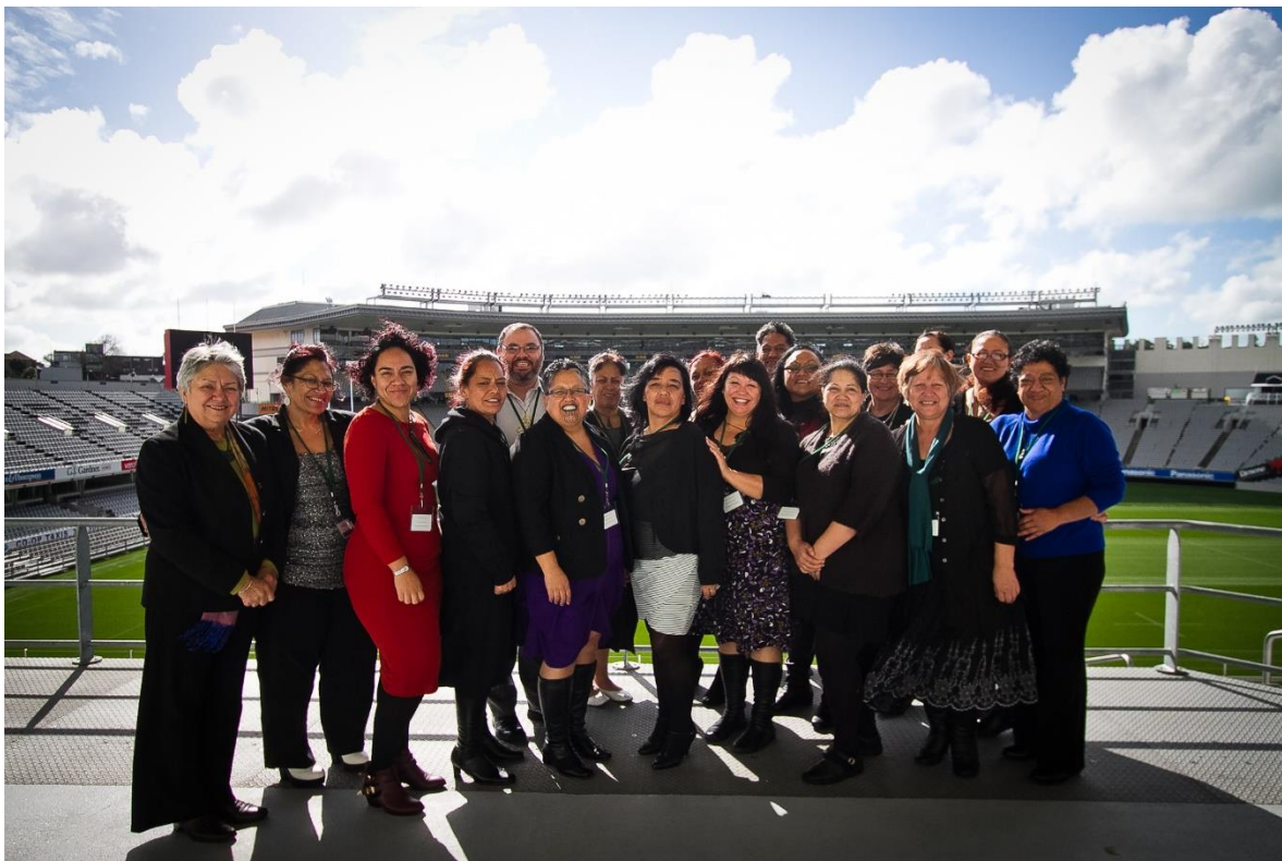
Te Poari o Te Rūnanga o Aotearoa NZNO

Te Rūnanga membership comprises over 3,240 nurses (nurse practitioners, registered, enrolled and student nurses), midwives; kaimahi hauora, health care assistants and allied health professionals.