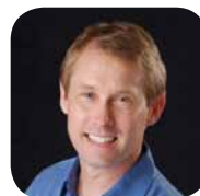
Bart Conner Emcee