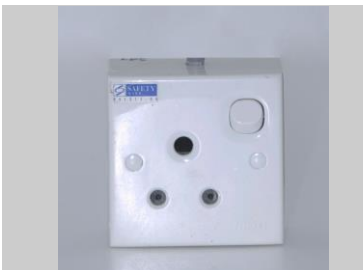
15A/230V SP 50/60 Hz Powerpoint (Not for lighting use)