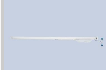
40W 1.2mL Fluorescent Light (Loose Fitting)