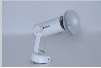
100W Standard Spotlight