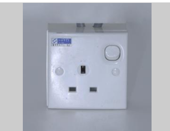
13A/230V SP 50/60 Hz Powerpoint (Not for lighting use)