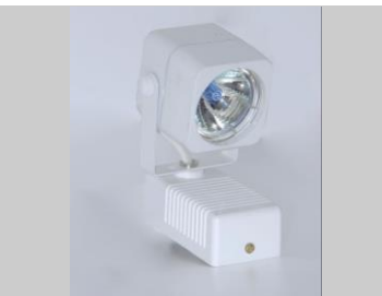
50W Standard Halogen Spotlight