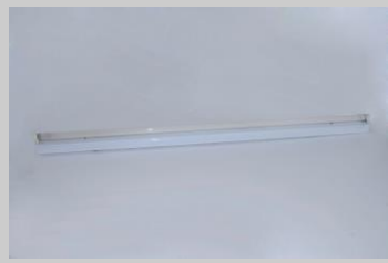
40W 1.2mL Fluorescent Light (Batten Fitting)