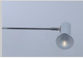
100W Long Arm Spotlight